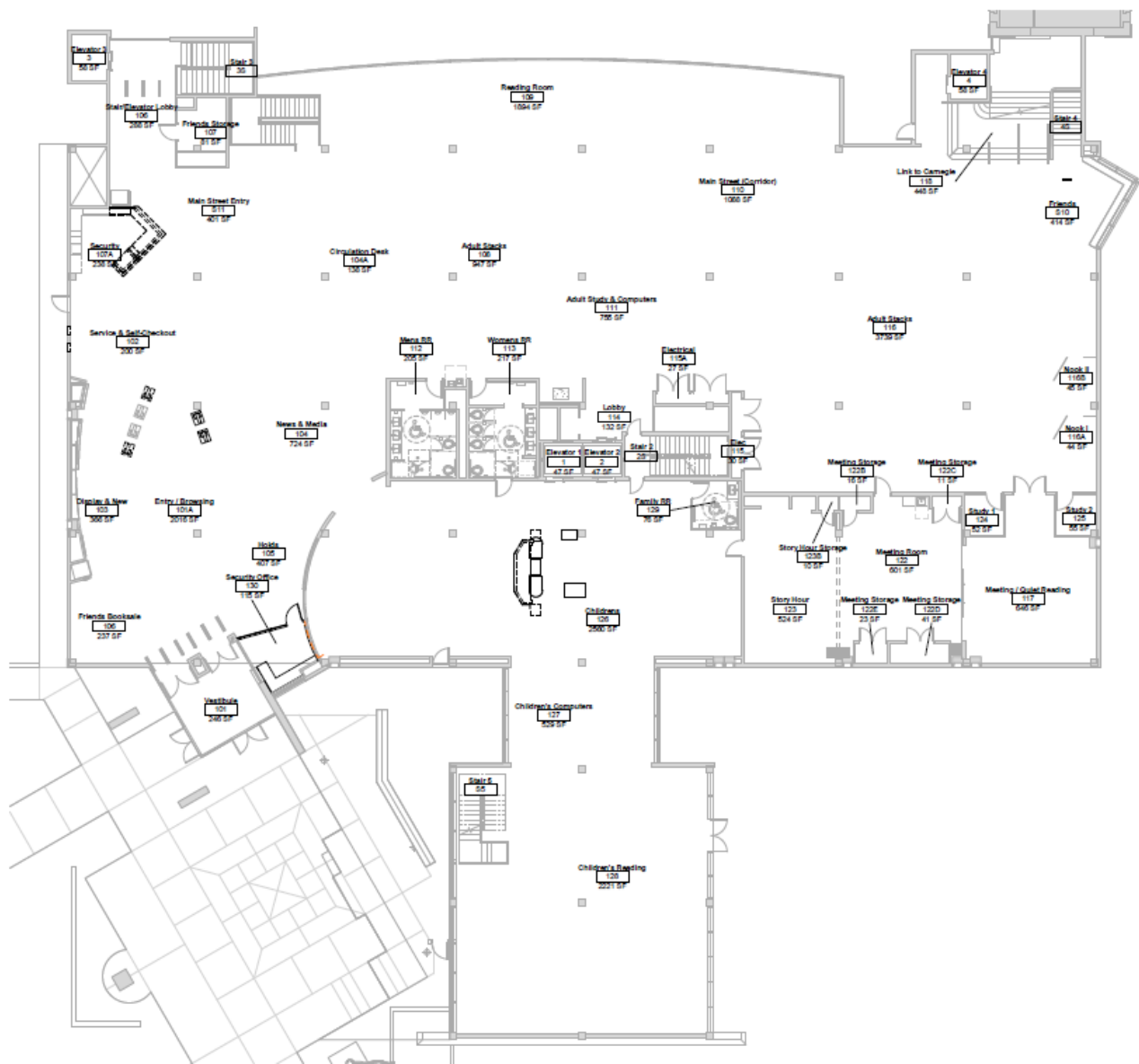
PENROSE LIBRARY FIRST FLOOR