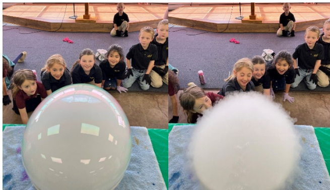
Dry Ice Lightning Lesson

FCS Services staff visited Otero Elementary, Fremont, Kilmer, Encompass Heights, Springs Baptist Academy, Wildflower, TCA Central, and Aragon for Lightning Lessons. PPLD attended Carnival Nights and STEM nights, and delivered Summer Adventure fliers to Coperni2, Coperni3, Jackson, Colorado Springs Military Academy, Wildflower, Spark Online, Springs Baptist, Carver Elementary, Pioneer Technology and Arts Academy, and Corpus Christi Catholic Academy. Summer Adventure presentations were presented to students at Woodmen Roberts Elementary, Spark Online Academy, Ranch Creek Elementary, Grand Peak, Inspiration View Elementary, and Mountain View Academy. In addition, Family & Children's Services staff throughout the district visited 40 schools and presented to over 7,700 students, teachers, and parents this month. This has been the most successful school outreach in May in recent years.